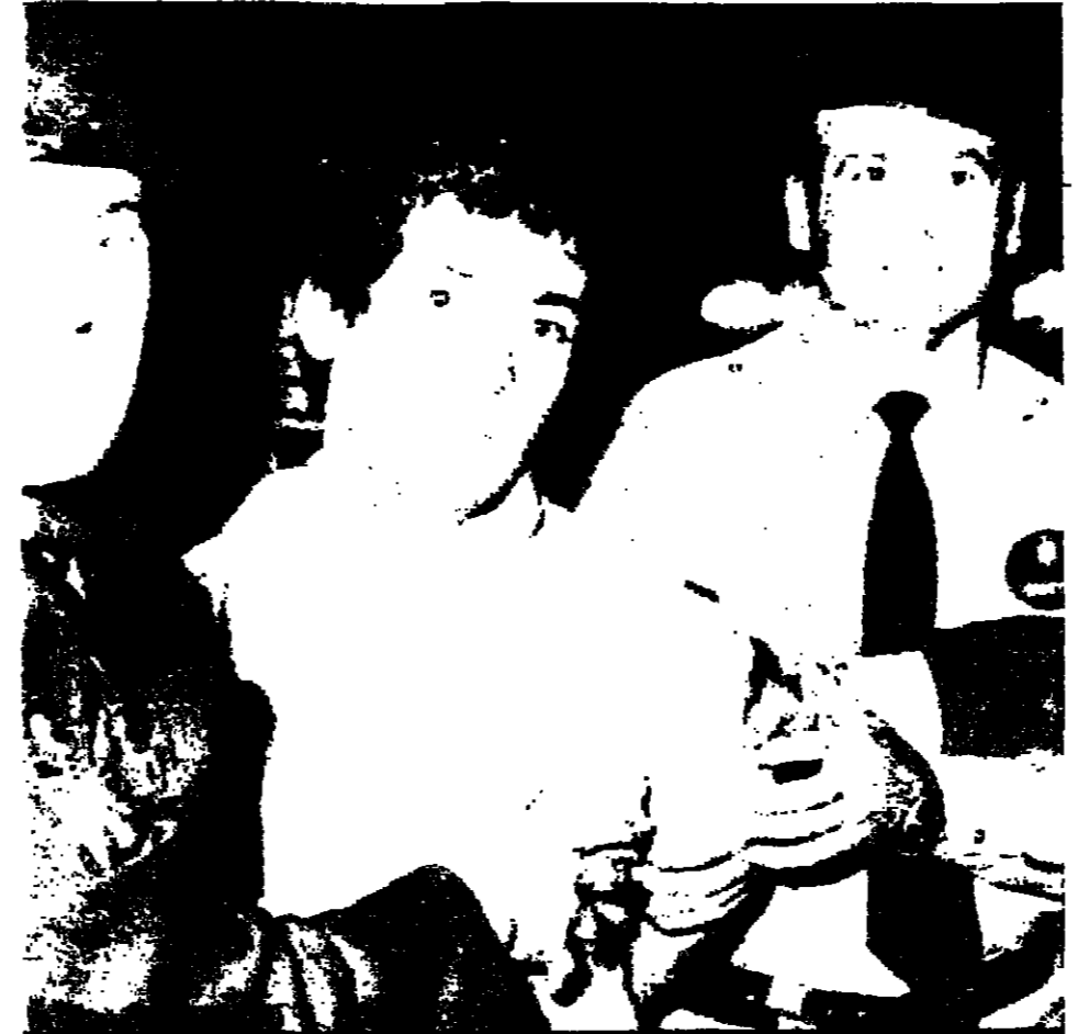
CAPTIVE TERRORIST: One of the gunmen who made a futile attempt to seize Barcelona's Banco Central Sunday being held captive by Spanish anti-terrorist police commandos. The over 70 hostages taken by the gunmen were rescued by the police who ended the siege with a gunfire assault.